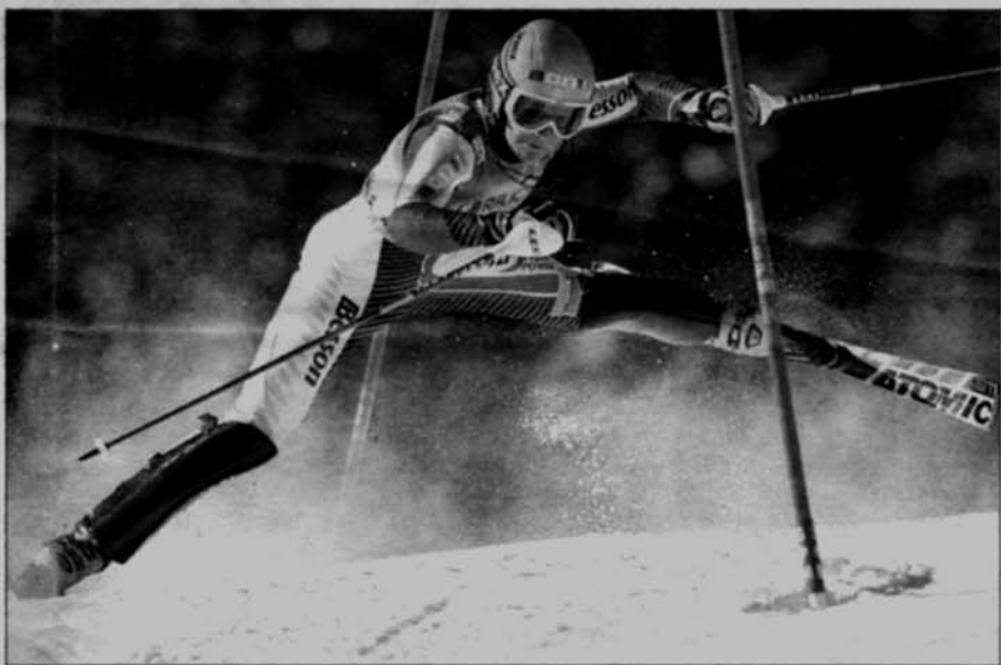
Austria's Marlies Schild skis out of control yesterday during the first run of Women's World Cup Slalom in Aspen, Colo. She crashed through the gates and did not finish the first run.